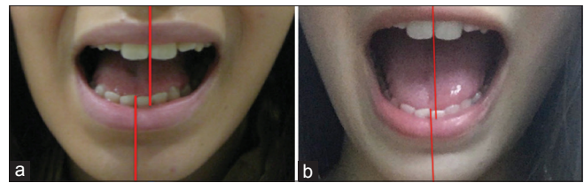
Figure 1: (a) Patient with intense right temporomandibular joint pain and mouth opening limitation to 12 mm with right deviation. (b) Patient after temporomandibular joint arthrocentesis and viscosupplementation with 36 mm mouth opening and partial correction of mouth deviation

As previously described in the literature, TMJ arthrocentesis is an effective treatment for acute DD without reduction, reducing pain and limited mouth opening. [8,19,25,26] However, disc repositioning does not seem to play a major role since many authors report clinical success without changing disc position. [24] Many